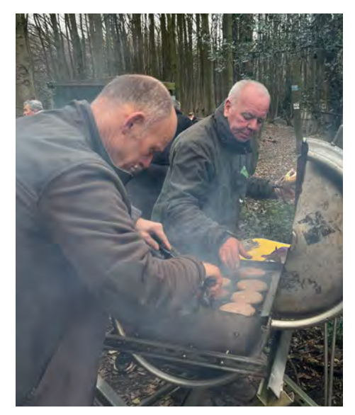
BBQ well stocked, cheers chaps.