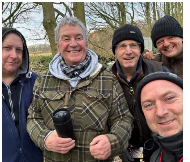
Some of the Castle Crew.